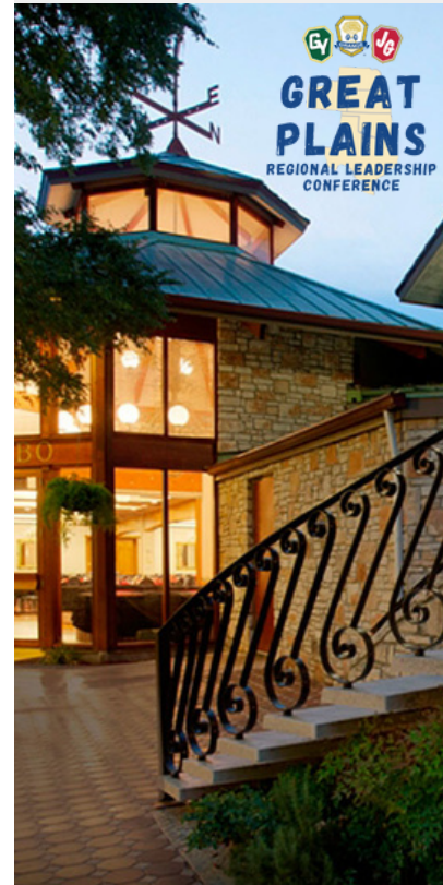
Inn of the Hills Hotel & Conference Center Kerrville, TX Location of 2023 Great Plains Regional Leadership Conference