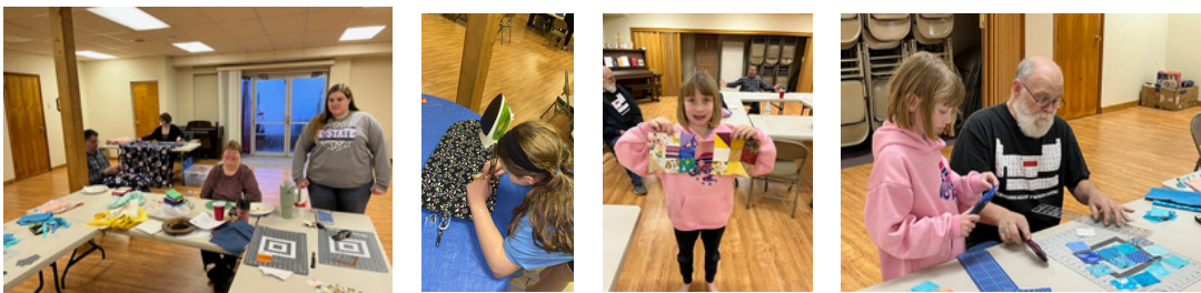
Pleasant View Members during the March meeting