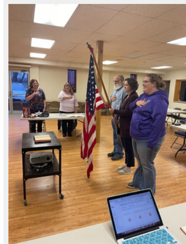
Flag Presentation at March Meeting