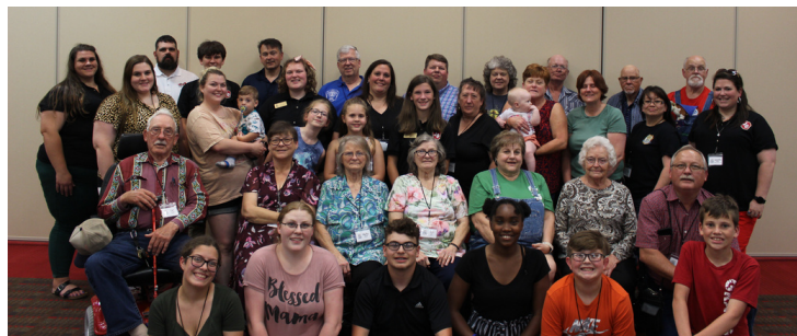
Great Plains Regional Conference 2022 Attendees