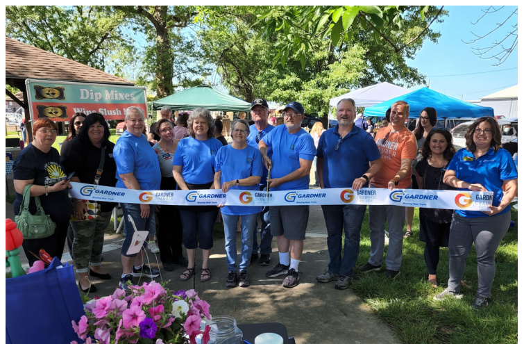
Gardner's Farmers Market Ribbon Cutting